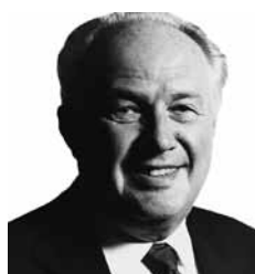
DR FRANZ HUMER

Diageo was formed in 1997, following the merger of GrandMet and Guinness, and is headquartered in London. The word Diageo comes from the Latin for day (dia) and the Greek for world (geo). We take this to mean every day, everywhere, people celebrate with our brands.